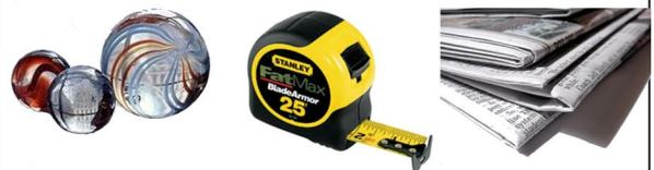
a Marble Tape Measure News Paper