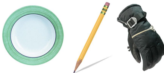
Plate Pencil Glove