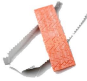
Piece of gum