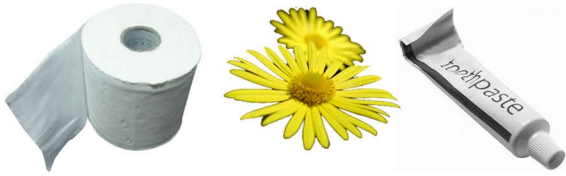
Toilet Paper Flower Toothpaste