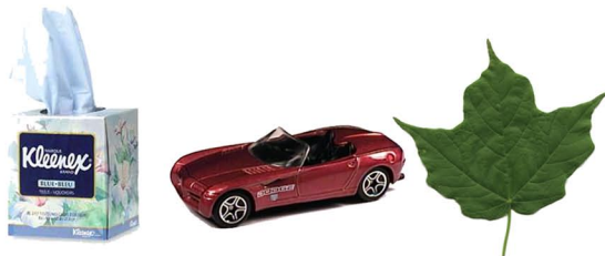
Kleenex Toy Car Leaf