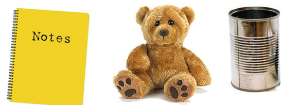
Notebook Stuffed animal Can