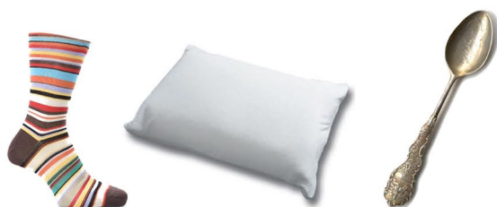
Sock Pillow Spoon