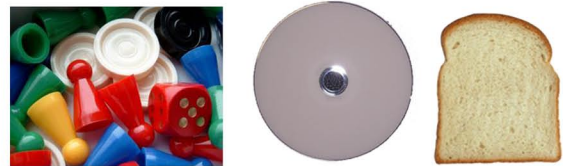
Game Piece CD Slice of bread