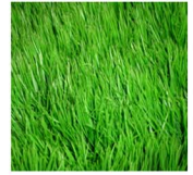
Piece of grass