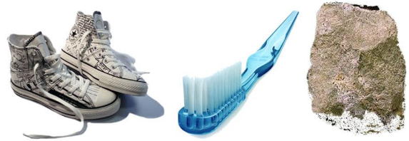
Shoes Toothbrush Rock